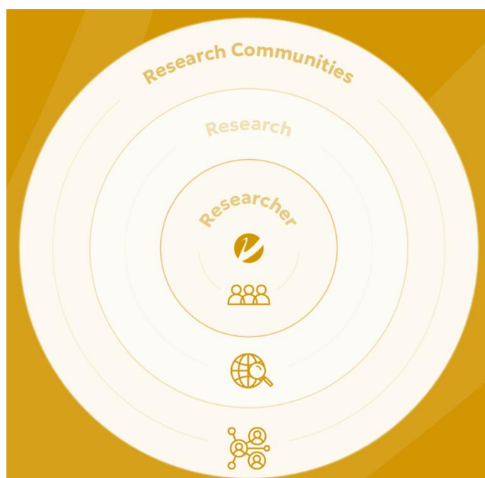
Figure 1: The Researcher Development Framework. An adapted visual representation of the Researcher Development Framework, highlighting the researcher at the centre, surrounded by their research activity and the wider research communities that support and shape their development. Image adapted from Vitae.

Our programmes are aligned with the Vitae Researcher Development Framework 2025 (RDF 2025) , a sector-leading model that defines the values, knowledge and behaviours of effective researchers. Our workshops have been designed to support the researcher, the research and the research communities. For each workshop we have highlighted up to six key areas mapped onto the researcher development framework.